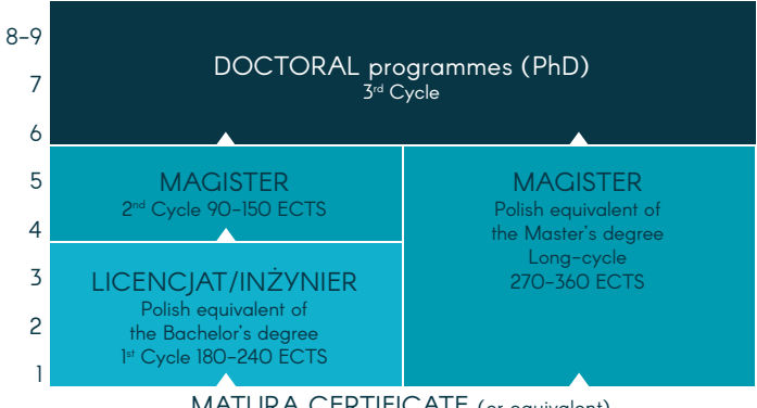
MATURA CERTIFICATE (or equivalent)

Students enrolled at Polish higher education institutions can choose between full-time and part-time studies. Full time is the standard mode and is usually free of charge in state higher education institutions. The courses may take the form of lectures, practical classes, workshops, seminars, laboratory classes and practical placements.